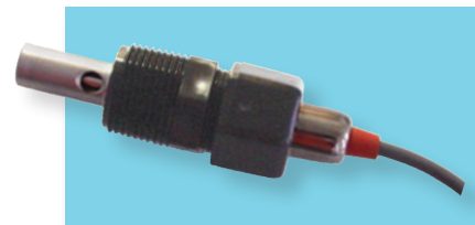
Assembled Resistivity Sensor

The CS10 was designed primarily for use in pure water applications.